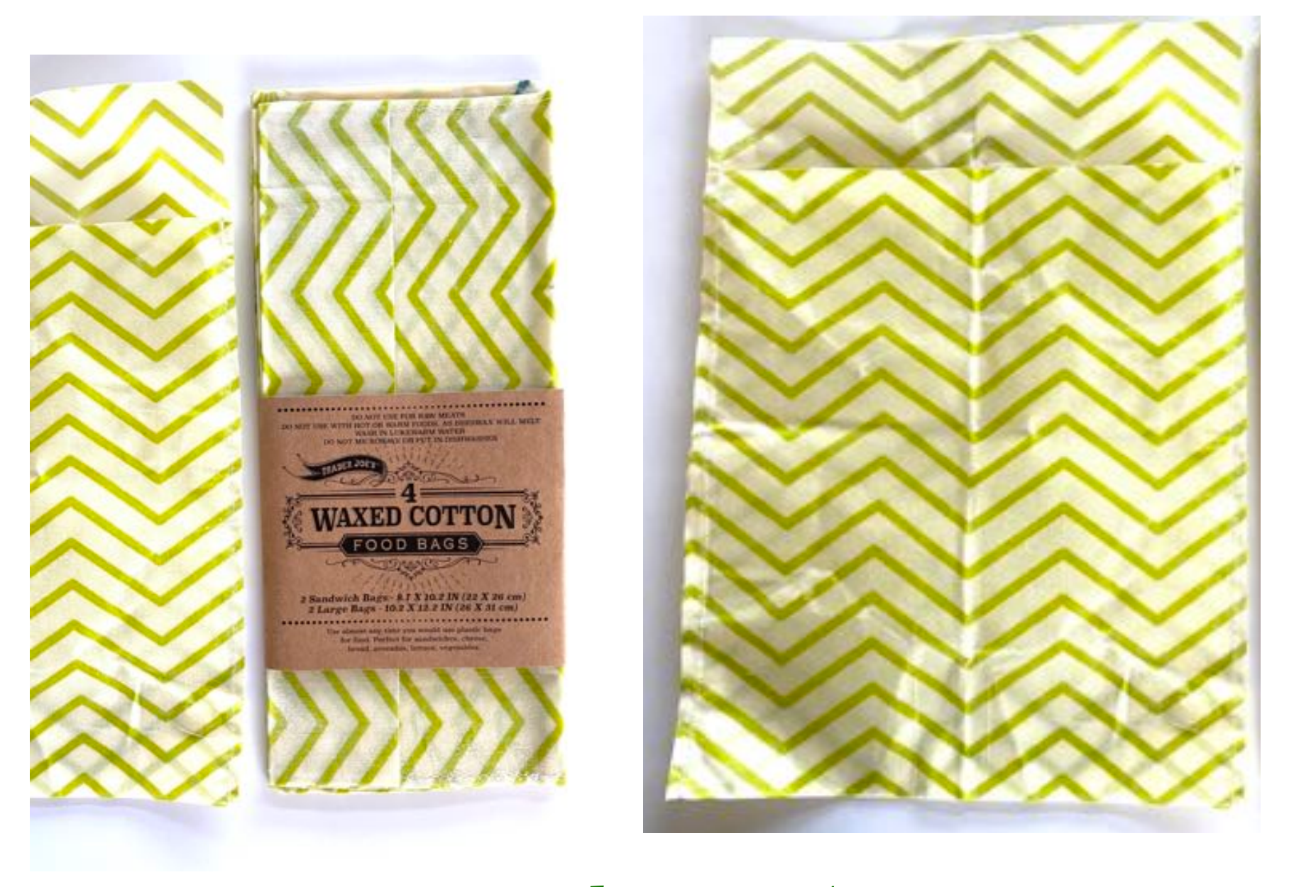
Beeswax Food Wraps, $18.00

Manufactured from organic cotton, sustainably harvested bees wax, organic jojoba oil, and tree resin, this uniquely designed plastic-free and Eco-friendly beeswax food wrap is a natural alternative for plastic-free food storage. All wraps are handcrafted, providing the highest-quality, and are washable, reusable and fully biodegradable. No synthetic wax or chemicals are used, allowing food to stay fresh and safe at all times during an emergency.