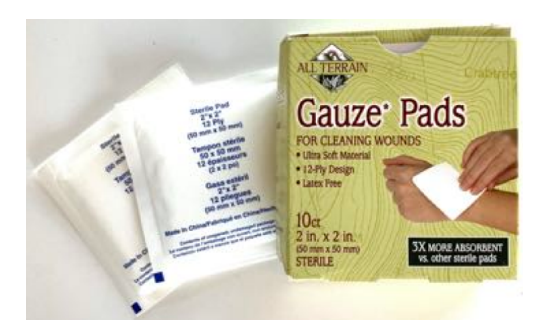
Gauze Pads, $6.75

These ultra-soft, latex-free and 100% sterile Gauze Pads are ideal for both cleaning and covering minors cuts, scrapes, or burns without sticking to them. Environmentally conscious, All Terrain's products are manufactured from all-natural ingredients and even the packaging is made from recyclable and biodegradable material.