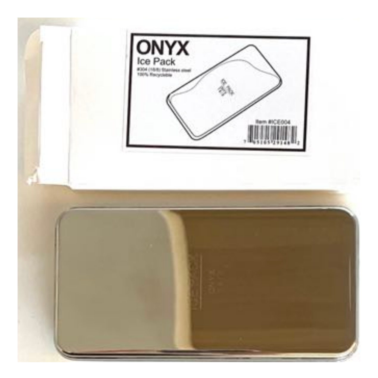
Stainless Steel Ice Pack, $19.95

This sleek stainless steel ice pack may be super small, slim, and lightweight —it's the size of a small iPod and looks like one too—but it's filled with distilled water and freezes in just a couple hours. It's 100% non-toxic unlike many of the mystery gels contained within traditional plastic ice packs, meaning it can go directly next to your food without there being a risk of contamination or leakage. Alternatively, it could also provide much needed relief for sore backs, headaches, bruises, or bumps. This is a great lowwaste alternative!