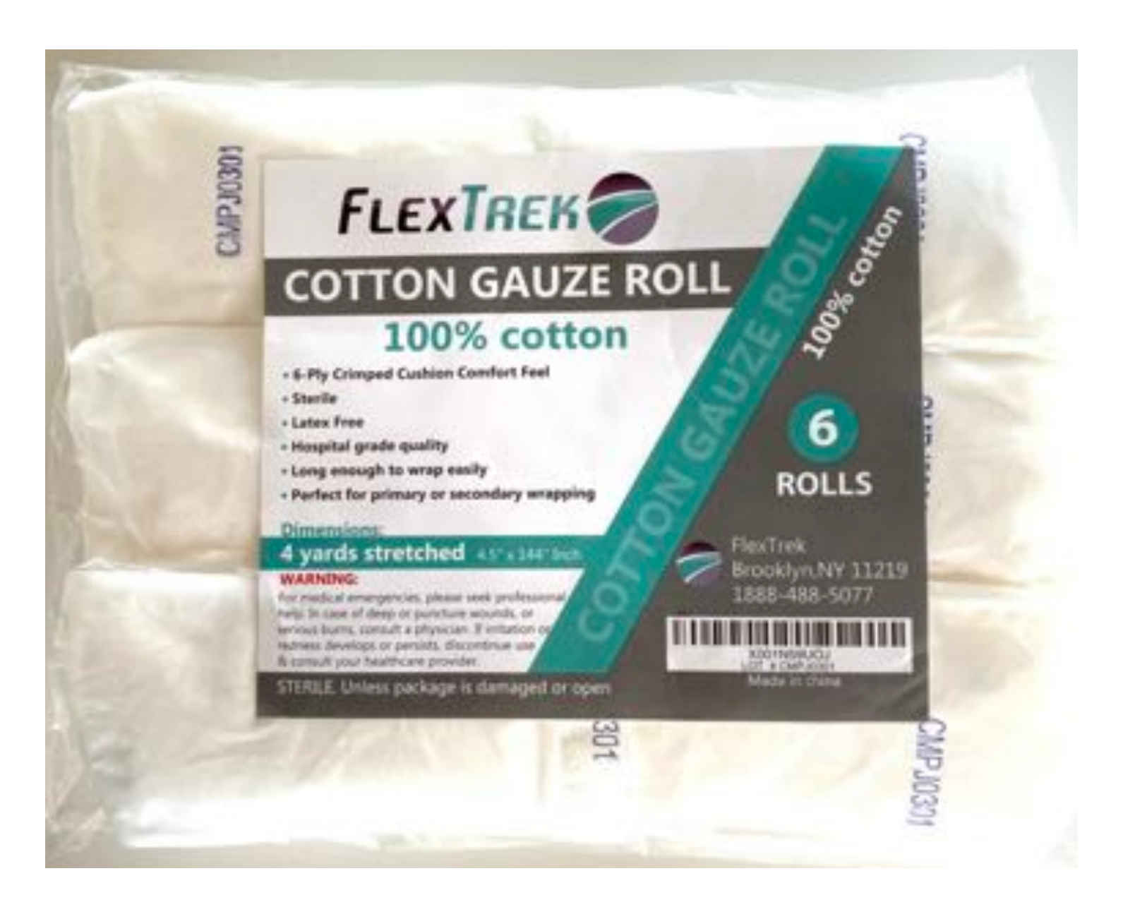
Cotton Medical Bandage, $14.99

Trusted by medical professionals, these FlexForm gauze bandages are an essential in every first-aid situation. They are durable, stretchy, flexible, and easy to apply, perfect for wrapping sprain joins, burns, cuts, and grazes, or to secure nonstick gauze pads to wounds without slippage. The gauze raps are manufactured from 100% pure cotton, one of the most absorbent elements in nature and the easiest to keep sterile. This ensures that wounds can be safely protected from dirt and bacteria in the most environmentally conscious way.