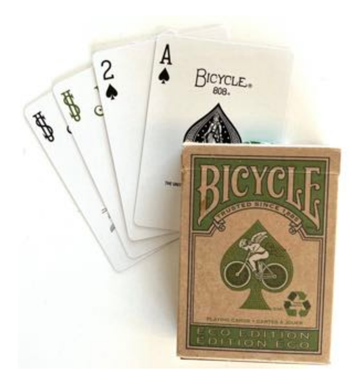
Eco-Edition Playing Cards, $3.39

Board or card games have always been a great way to create enjoyable experiences for both kids and adults alike. Most games can be pretty detrimental to the environment, though, arriving in plastic materials and an abundance of unnecessary packaging. Nowadays, however, there are endless possibilities for greener ways to play. These high-quality playing cards are manufactured with a fully recyclable case and deck. The cards themselves are made with sustainable forest papers, and the designs are printed using starch-based laminating, and vegetable-based inks.