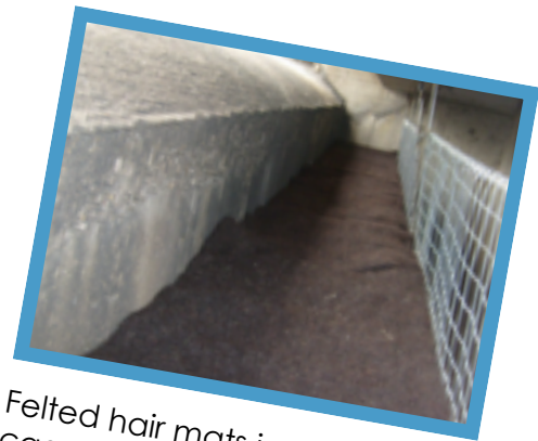
Felted hair mats in storm drain cages, in partnership with InletGuard